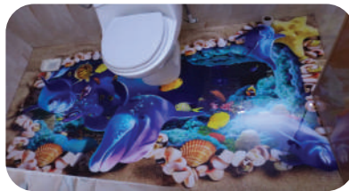
3D Epoxy Flooring Solution