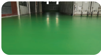
PU Flooring Solution