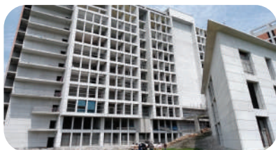
Fair Face Plaster