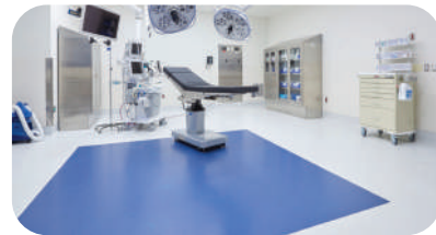
Vinyl Flooring Solution