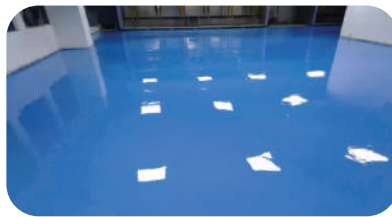
Epoxy Flooring Solution