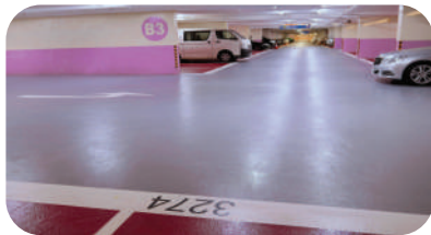
Epoxy/PU Parking Flooring