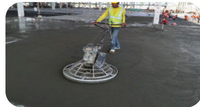
Floor Hardener Solution