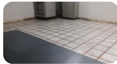
ESD Epoxy Flooring