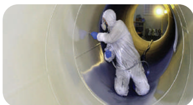
ETP Protective Coating