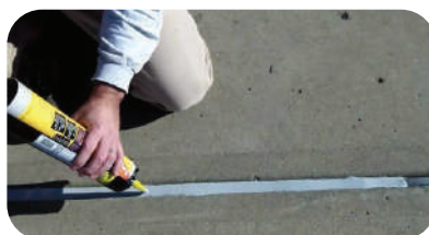
Expansion Joint Work